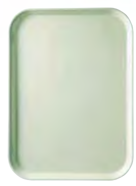
Key Lime (429)